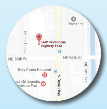
Holy Cross COPD Clinic 5601 N. Dixie Highway, Suite 412 Ft. Lauderdale, FL 33334